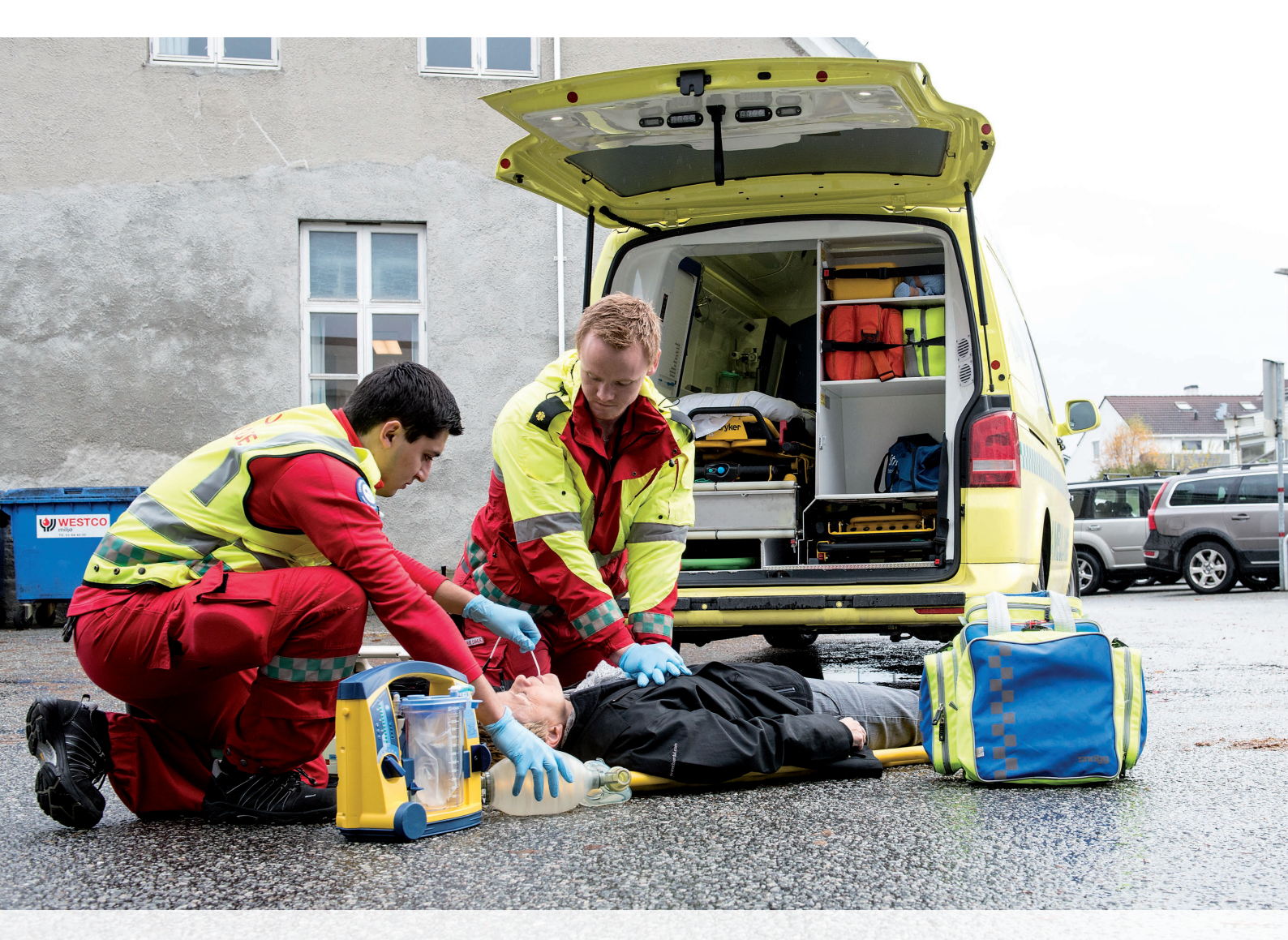
The Laerdal Suction Unit - now even better