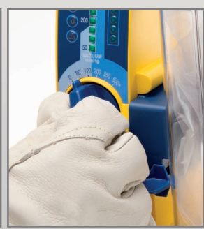
and adjust even with firefighter's gloves Wall Bracket even when using gloves