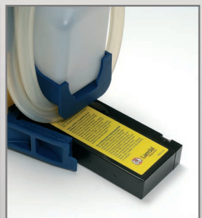
Ease of use is assured with a "No Tools" This large, single knob is easy to turn on The LSU is easy to release from the required replaceable battery, built-in charger, and multiple power options