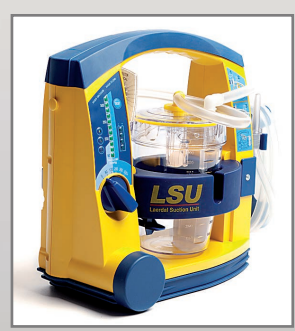
A fully reusable canister system is also